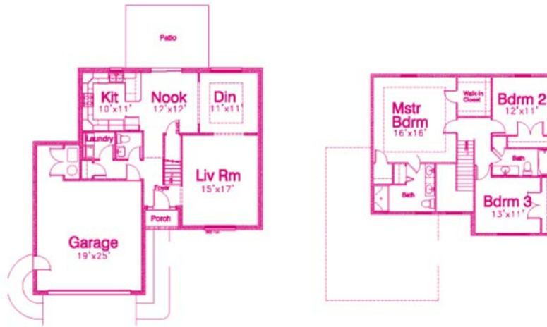
Design Basics's Duncan Plan